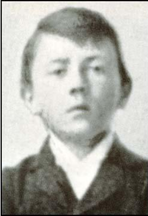
Adolf Hitler, Age 10

“Hitler loved his indulgent mother, and she in turn considered him her favorite child, even if, as she said, he was moonstruck. Later, he spoke of himself as his mother's darling. She told him how different he was from other children. Despite her love, however, he developed into a discontented and resentful child. Psychologically, she unconsciously made him, and through him the world would pay for her own unhappiness with her husband. Adolf feared his strict father, a hard and difficult man who set the pattern for the youngster's own brutal view of life...”